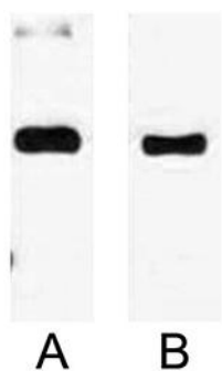
Fig. Western blot analysis of 1ug Trx Tag fusion protein with Anti-Trx Tag monoclonal antibody in 1:3000 (lane A) and 1:5000 (lane B) dilutions.

Note: The product listed herein is for research use only and is not intended for use in human or clinical diagnosis. Suggested applications of our products are not recommendations to use our products in violation of any patent or as a license. We cannot be responsible for patent infringements or other violations that may occur with the use of this product.