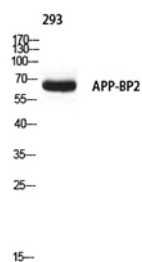
Fig. Western blot analysis of 293 using APP-BP2 antibody. Secondary antibody (catalog#: A21020) was diluted at 1:20000.

Note: The product listed herein is for research use only and is not intended for use in human or clinical diagnosis. Suggested applications of our products are not recommendations to use our products in violation of any patent or as a license. We cannot be responsible for patent infringements or other violations that may occur with the use of this product.