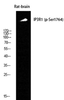
Fig. Western Blot analysis of Rat-brain cells using Phospho-IP3R-I (S1764) Polyclonal Antibody.

Storage Instructions: Stable for one year at -20°C from date of shipment. For maximum recovery of product, centrifuge the original vial after thawing and prior to removing the cap. Aliquot to avoid repeated freezing and thawing.