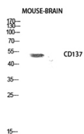
Fig. Western Blot analysis of Mouse-brain cells using CD137 Polyclonal Antibody diluted at 1:500.

Note: The product listed herein is for research use only and is not intended for use in human or clinical diagnosis. Suggested applications of our products are not recommendations to use our products in violation of any patent or as a license. We cannot be responsible for patent infringements or other violations that may occur with the use of this product.