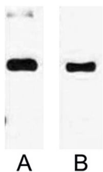
Fig. Western blot analysis of 1ug Trx Tag fusion protein with Anti-Trx Tag monoclonal antibody in 1:3000 (lane A) and 1:5000 (lane B) dilutions.

Note: The product listed herein is for research use only and is not intended for use in human or clinical diagnosis. Suggested applications of our products are not recommendations to use our products in violation of any patent or as a license. We cannot be responsible for patent infringements or other violations that may occur with the use of this product.